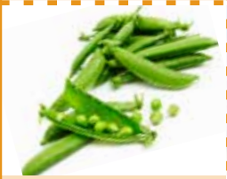
Sugar Snap Peas