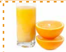
100% Fruit Juice

Put an X through the squares of fruits, vegetables and physical activities you try. Get five in a row, column or diagonally for a BINGO!