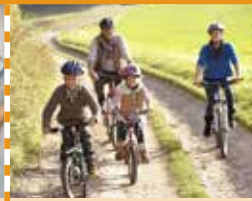
Ride (a bike)