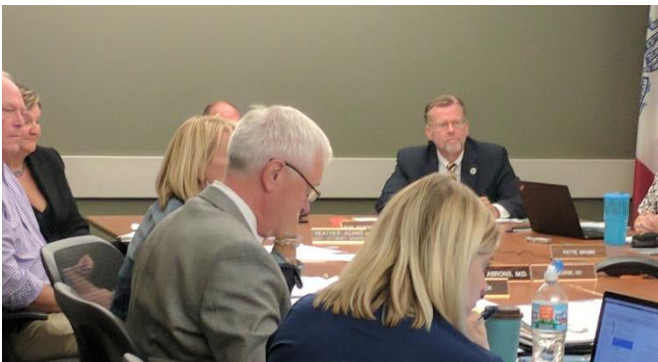
The Iowa State Board of Health pictured at its September 2017 meeting.

Reviewed earlier this month by the State Board of Health, the proposed Administrative Rules to govern the manufacture and dispensing of medical cannabidiol are open for comments. A public hearing on the Rules is scheduled for December 8, 2017.